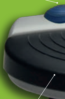
Speed Control Pedal